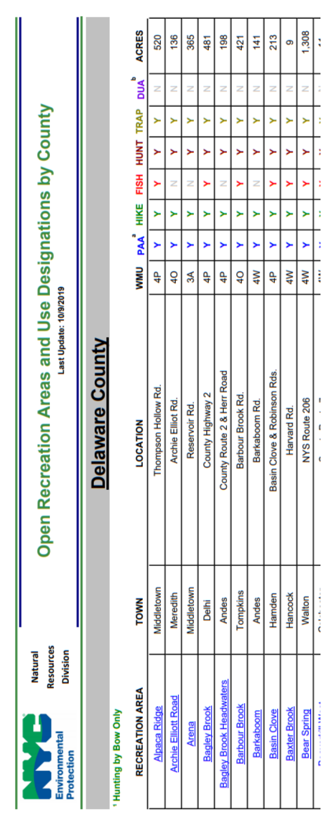
Figure 1. The index to the recreation area maps

The power of this minimalist approach to Tcl development is perhaps best illustrated by following the workflow of one typical import. In this case, the external data set that is to be brought in are the boundaries of some four hundred areas, of sizes ranging from a few thousand square metres to a few tens of square km, that are maintained by New York City outside its city limits to protect them from development (and therefore from polluting the watershed that supplies its drinking water). Since these areas are wellmarked, and open to the public for recreations like hiking and bird-watching (and often for hunting, fishing and trapping as well), it seemed a good idea to map them in OpenStreetMap.